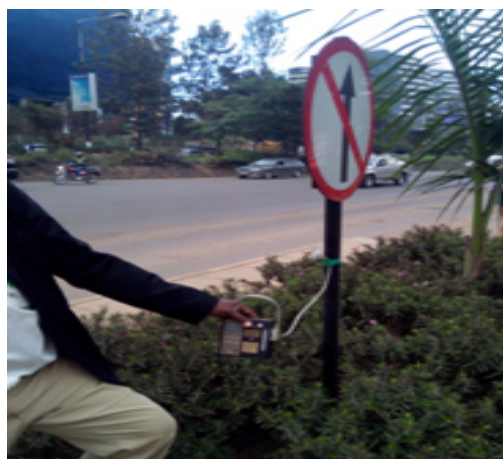
Figure 1 MEASURING OF PM ALONG WAIYAKI HIGHWAY

Particulates Matter (PM 10 ) at various sites of the study was determined by instruments acquired from Ministry of Labor, Occupation Health Services section. Figure 2 is Photograph of the instrument of measuring particulate matter in air to indicate the level of air pollution. Particulate matter instrument has a diaphragm which was placed at sites and sucked in air from environment at a rate of one cubic meter per second for twelve hours. This action was done three times, one at beginning of the study another when experiment was half way done and lastly at the end of experiment. The diaphragm has a sieve which traps particles in air which passes through. Initial weight of sieve was taken (by balance that measures in μgm) before and after twelve hours. Since the amount of air passing through the diaphragm was known, calculation of μgm per cubic meter was performed. Table 1 shows how calculation was done after measurement of particulate matter (PM 10 ). This was as done by Lugadiru, (2016) paper.