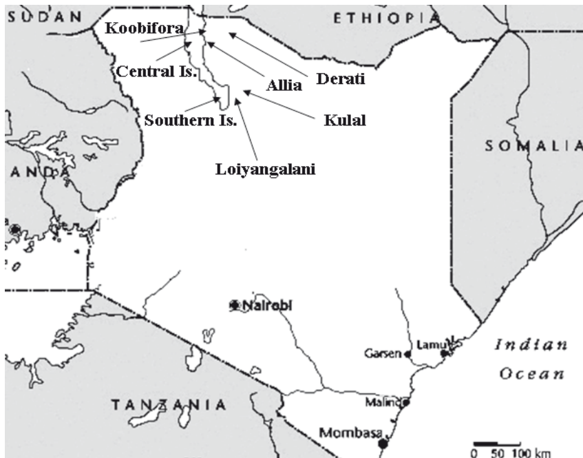
Fig. 1. — Lake Turkana with detail of the seven study sites.

Species identification followed DOLLMAN (1915-1916), MEESTER & SETZER (1971), DELANY (1975), KINGDON (1971-1974a, 1971-1974b, 1997), and was confirmed by comparisons with specimens at the National Museums of Kenya. The nomenclature is based on WILSON & REEDER (2005). Most mammals were released at the capture point, after being marked non-invasively by clipping fur in a unique, recognizable pattern (CAMERON et al. 1997). Each specimen was identified, its sex,