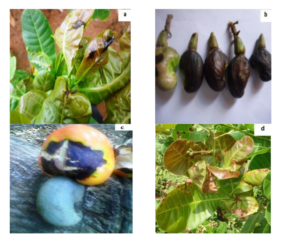
Fig 1 – Symptoms caused by Cryptosporiopsis sp. (cashew leaf and nut blight) a. Infected young tender cashew leaves with brown spots b. Infected cashew young nuts c. Infection on cashew pseudo-fruit. Panicle emerging from surrounding infected cashew shoots.

The criteria used for the selection of the sites were those: i) representing different agroecological zones, ii) having typical cashew growing system in the area, iii) following the traditional as well as modern agricultural operations, and iv) growing exclusively field crops with particular emphasis on cashew. The following four zones were sampled: Zone 1, South half of Mtwara Rural and South-East of Newala—unimodal rainfall with annual precipitation exceeding 1000 mm and 6 months of growing season (November–April), low attitude, isohyperthemic temperatures, low fertility soils. Zone 2, North half of Mtwara Rural—unimodal rainfall averaging 600–1000 mm in 6 months (November–April), mid altitude, isohyperthemic temperatures, low fertility soils with medium moisture retaining capacity. Zone 3, Masasi, North and West parts of Newala—unimodal rainfall averaging 600–1000 mm in 6 months (December–April), low attitude, isohyperthemic temperatures, low fertility soils. Zone 4, South East of Mtwara Rural—bimodal rainfall pattern with annual precipitation of over 600 mm, low altitude, growing season lasts 7 months (November– May), high fertility alluvial soils.