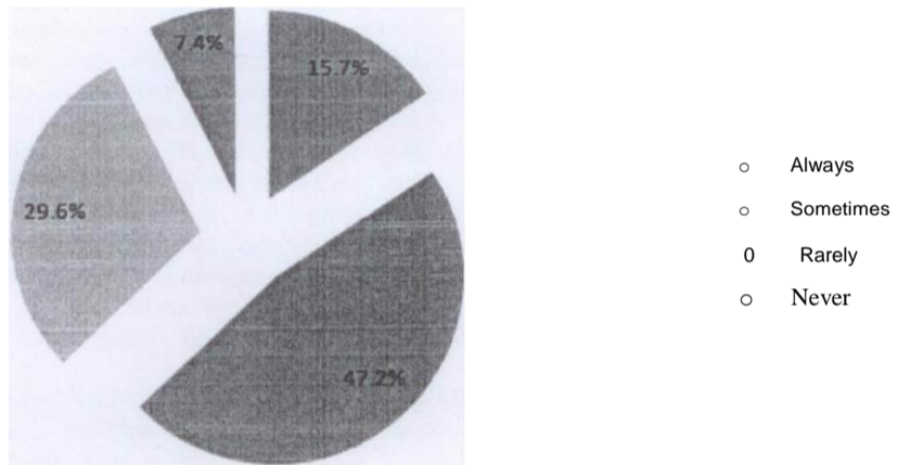
Figure 3: How often Students are sent home for fees

Data from figure 3 shows that majority (68) 62.9 % of the students indicated that they are always and sometimes sent home for school levies/fees while only (08) 7.4% are never sent home for fees. Those students who are rarely sent home for school levies/fees constituted (32) 29.6%. This implies that most of students are absent from school due to lack of the school levies/fees which may be due the parents' socio-economic status. This in turn affects students' academic performance.