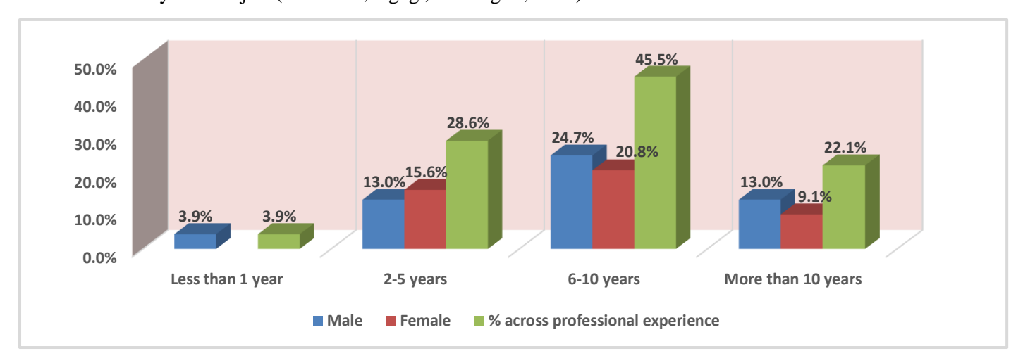
Figure 3 Teachers Gender and Professional Experience

Most of the male and female teachers had taught for 6 to 10 years at 24.7% and 20.8% respectively as shown in Figure 3. These were followed by females who had taught for 2 to 5 years (15.6%) and males who had taught for either 2 to 5 years or more than 10 years at 13% respectively. Only 3.9% of male teachers had taught for less than 1 year with no female teachers teaching for such duration. These findings show that most of the teachers had taught in the schools long enough to understand the issues facing their schools. This is important since work experience enhances mastery of a subject (Kamamia, Ngugi, &Thinguri, 2014).