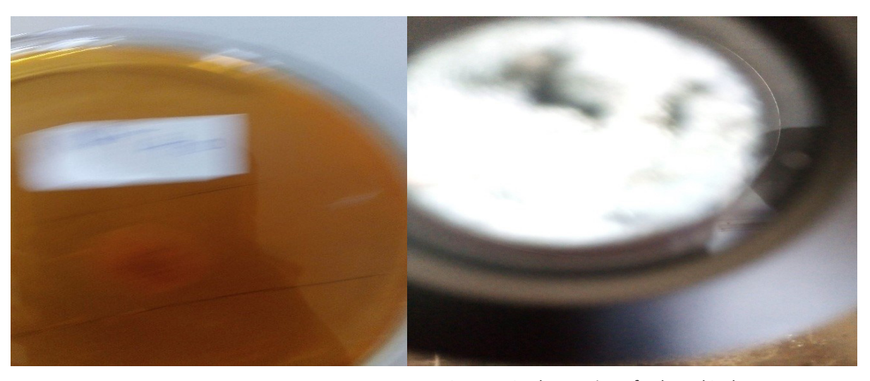
J-Kalenjin sample pure culture 2