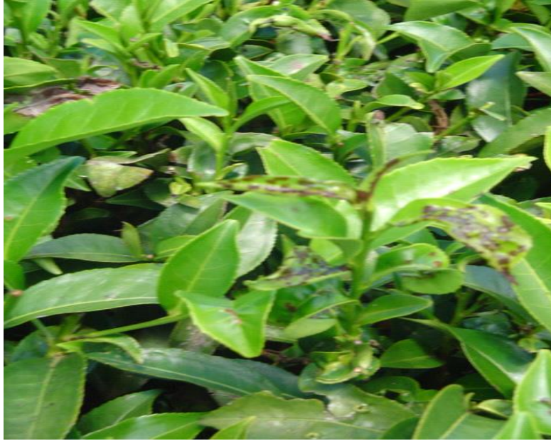
Plate 2. Dark brown feeding spots as a result of the Mosquito bug feeding on the Leaves.