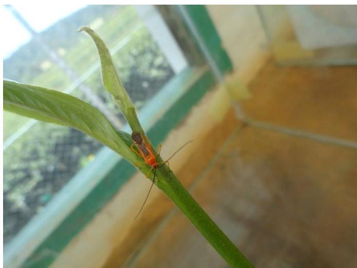
Plate 1. Adult Mosquito bug( Helopeltis schuotedeni Reuter).

problem in parts of Momul Tea Factory catchments in Kericho district, Kapkoros Tea Factory catchment in Bomet district and Kiamakoma Factory catchment in Kisii District of Kenya (TRFK, 2009).