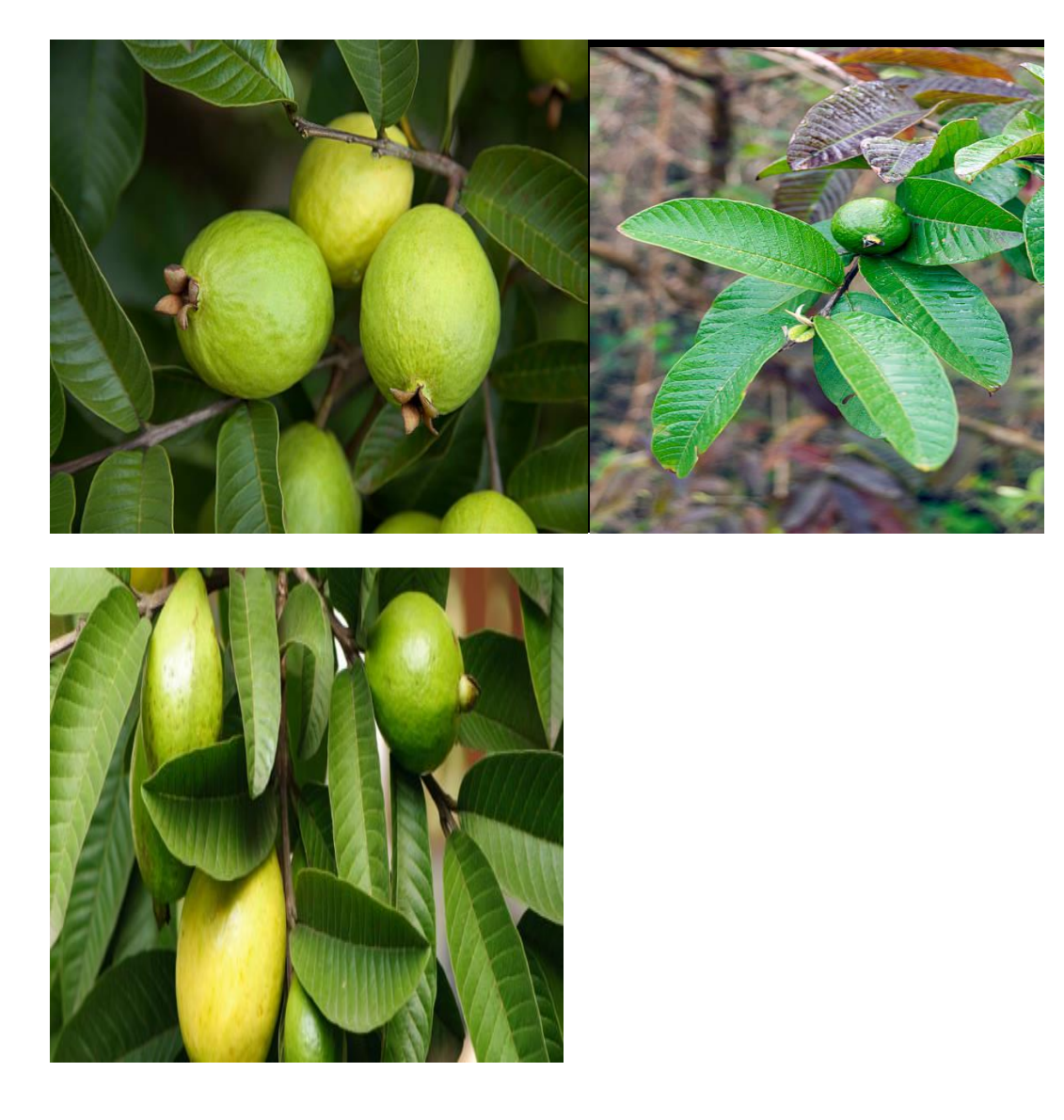
Figure 2.2: Guava leaf pictures