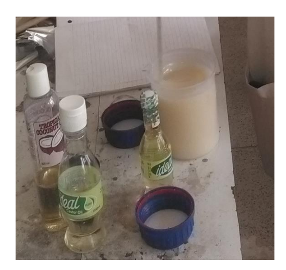
Figure 3: Soap ready to put in molds

finished product was natural and mild at that point as shown below.