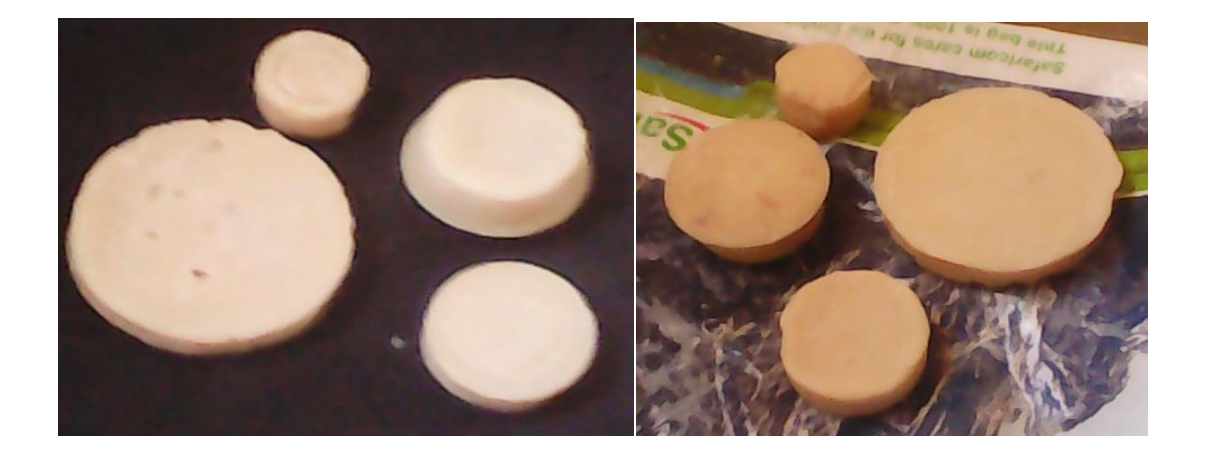
Figure 4: Soaps obtained after removing from molds