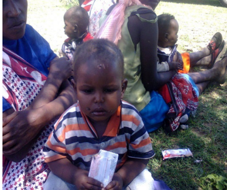
MUAC measurements of a Marasmic child