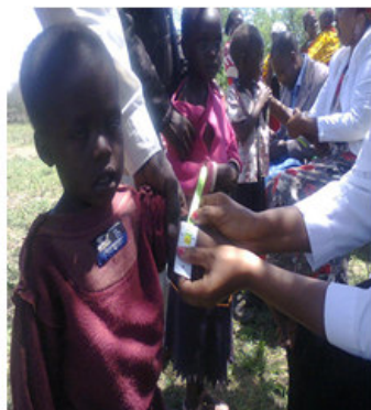
Picture 2 Health check of children