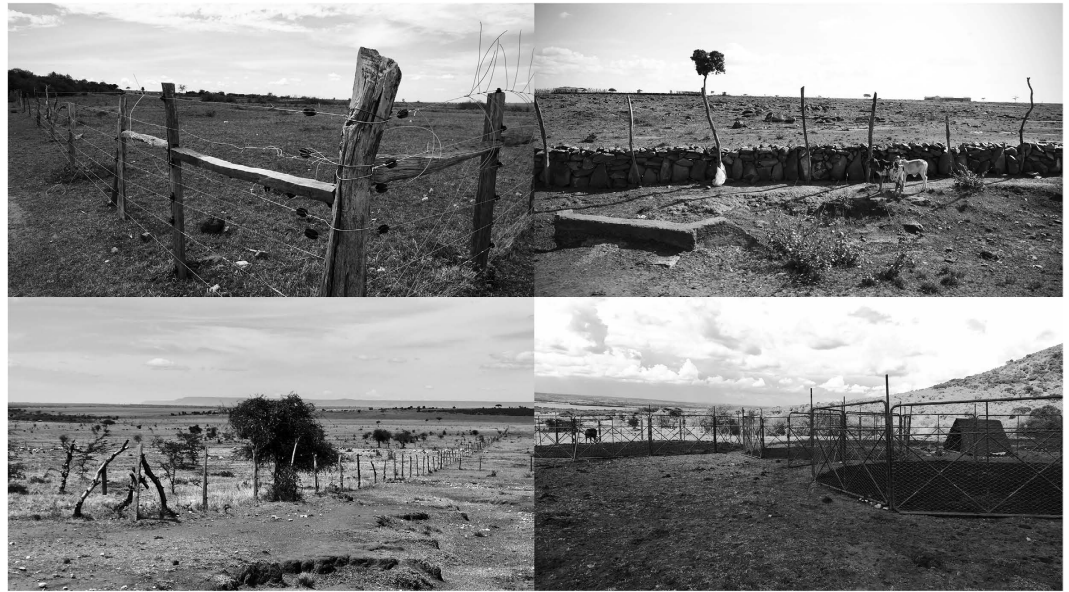
Figure 1. Examples of fences in the Greater Mara. By Mette Løvschal.

new game-proof fence to be built in 1966 that cut off and redirected a wildebeest migration with directly observable negative consequences on population size 11 .