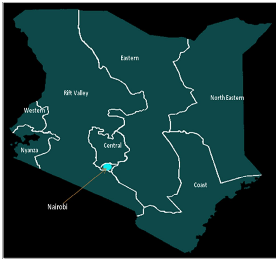
Figure 2: Location of Nairobi in Kenya, also indicating other provinces of Kenya.