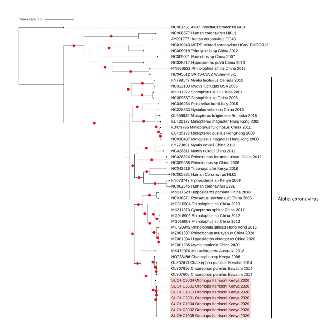
Figure 2. The Maximum Likelihood Consensus Tree Of The Coronavirus ORF1ab Sequences (8,475 Nucleotides), Constructed Esing 1000 Replicates With Branches Achieving ≥95% Bootstrap Support Annotated By Red Dots.

Further analysis of the coronavirus contigs in samples revealed segments of S, NS3b, E, M and N regions, encoding for the virus structural and other accessory proteins (Table S2). Sequences of the additional coding region—ORFx, involved in host immune modulation in bat coronaviruses [35], were present in six samples. The complete ORFx deduced amino acid sequences were identical in five samples, being 34.2% divergent from the closest sequence reported previously from Kenya (Figure S2). We could further characterize complete M regions in six samples, with limited intragroup diversity (Figure S2). Multiple segments covering virus spike S1' and S2' sections could be identified in a single sample, which revealed fusion peptide motifs and S2' furin cleavage sites involved in processing (Figure S3).