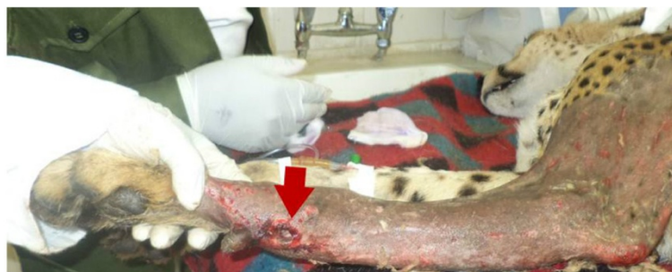
Figure 1 Injured left forelimb. Note the wound on the caudo-medial aspect of the antebrachium (arrow).