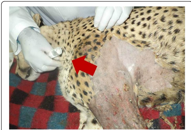
Figure 3 Brachial plexus nerve block. This was achieved through blind needle placement by introducing a hypodermic needle (arrow) through a point cranio-medial to the scapula-humeral joint and advanced in a caudo-dorsal direction.

orthopaedic procedure. Absence of autonomic cardiopulmonary reactions to the surgical manipulation may be attributed to the efficacy of brachial plexus block. Apart from lidocaine, other local anaesthetics can be used; bupivacaine has been shown to confer long term perioperative analgesia while ropivacaine provides superior analgesia with minimal motor effects [18] owing to the fact that it is less potent at blocking A \beta fibres, but more potent in blocking A \delta and C fibres [19].