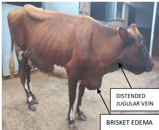
Fig. 1: The animal standing looking anxious, with a distended jugular vein, and brisket edema.

General examination revealed fairly good body condition of about 3.5 in a scale of 5, dull and depression, flared nostrils, predominant abdominal breathing, brisket and submandibular edema, careful gait carrying, pronounced abduction of elbow, extended head and neck, distended jugular vein and, grunting and teeth grinding (Fig. 1 and Fig. 2). Physical examination revealed respiratory rate of 24 breathes per minute, pulse rate of 92 beats per minute, temperature of 40.7°C, grunting of tracheal auscultation, coughing, Ventral Oedema, splashing heart sound, suppress thoracic respiration and harsh lung sounds.