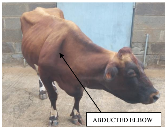
Fig. 2: The same cow showing abducted elbow and scapular and depressed (arrow).