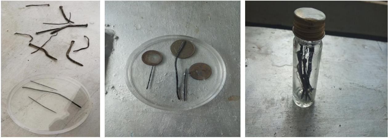
Fig. 7: Various foreign bodies found in the reticulum (the wires in the petri-dish penetrated to pericardium)