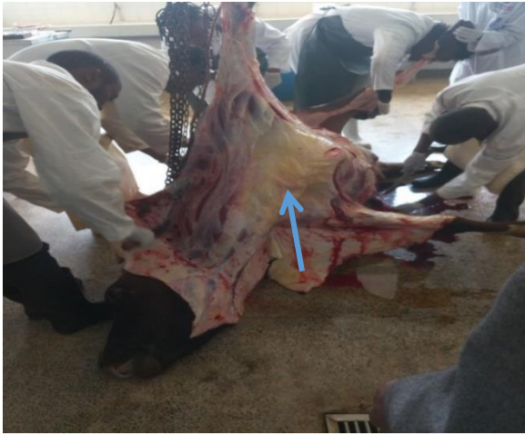
Fig. 3: The carcass present observed subcutaneous Edema (arrow).